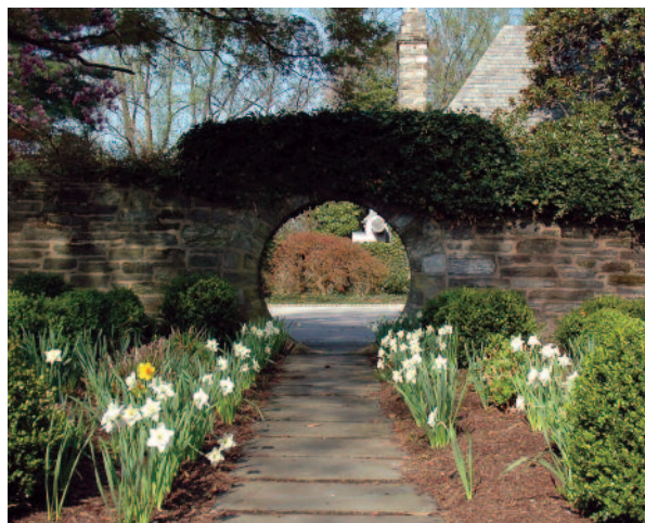
The Moongate at St. Timothy's School