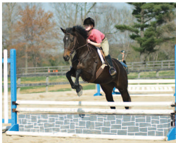
Riding at St. Timothy's School

Tuition is $6,000. This includes all meals, books & materials, local transport, use of campus facilities, housing, class-related trips, and transportation to and from BWI and Dulles Airports.