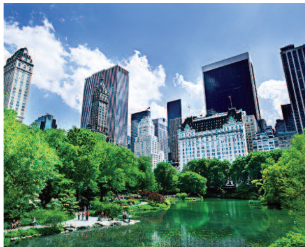
Central Park, New York

Tuition is $5,800. This includes all meals, books and materials, local transport, use of campus facilities, housing, class-related trips, and transportation to and from BWI or Dulles Airports.