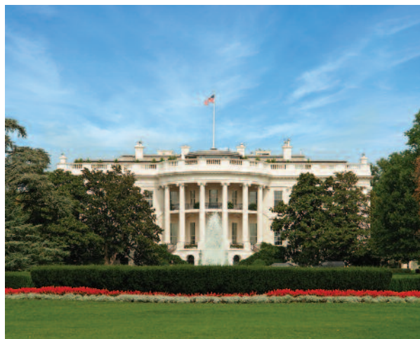
The White House, Washington, DC